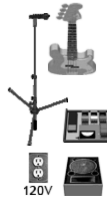
Wedge Lyric Monitor Band Owned