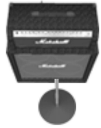
Lead Gtr Amp